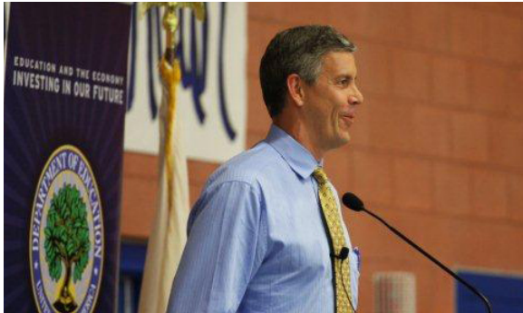
Arne Duncan, US Secretary of Education

The Safe Schools/Healthy Student Grant Initiative gave ERUSD the opportunity to turn many things around in terms of student and school safety within the city of Pico Rivera, and when U. S. Secretary of Education Arne Duncan came to a Town Hall Meeting in October, he got a look at what local districts, students, teachers, and parents can accomplish in a very short time. And that look was impressive, indeed!